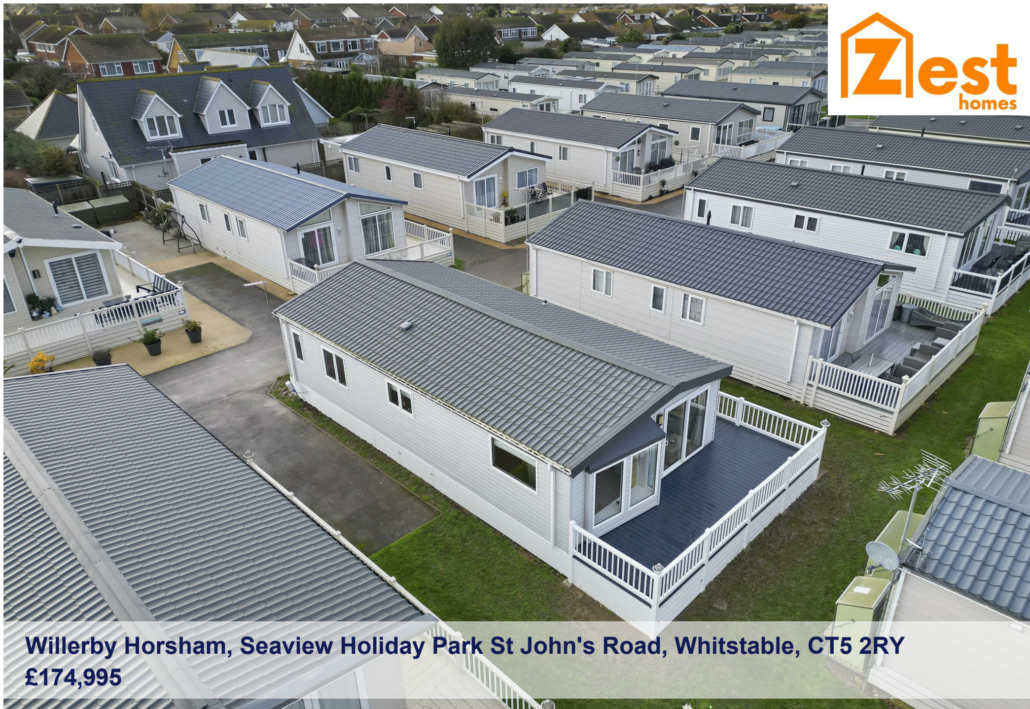
Willerby Horsham, Seaview Holiday Park St John's Road, Whitstable, CT5 2RY £174,995